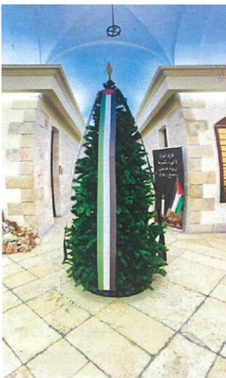
The tree in the corridor of De La Salle Hall with the names of over 5000 children who were killed in Gaza.

Given that backdrop, it is difficult to welcome the Christ child with joy! As a result, all festivities in Bethlehem have been cancelled and our remembering Christmas on campus is very subdued. Instead of the festive lighting of the Christmas tree, we had a somber remembrance of the children who have been killed in Gaza. There were four panels on the tree with some 5000 names of the children who are known to have died. We also had a different Christmas scene in the Chapel of the Divine Child reflecting this reality.